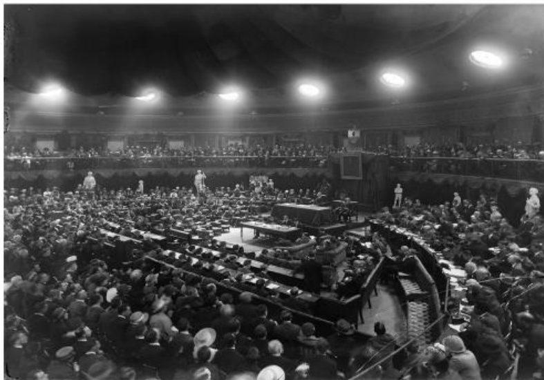
The Keogh Photographic Collection (The National Library of Ireland Catalogue)

The majority of the signatories of the Proclamation of the Republic were Irish speakers and members of Conradh na Gaeilge and the proceedings of the first meeting of Dáil Éireann in 1919 were held in Irish.